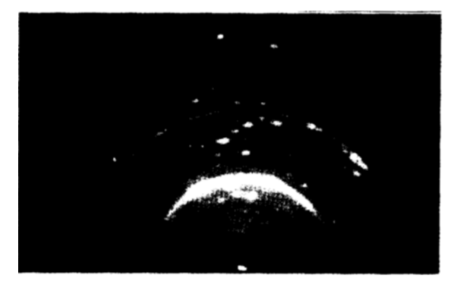
Fig. 2. Typical electron-diffraction pattern of a diamond-like film in a later stage of deposition after filling of the silicon surface with carbon.